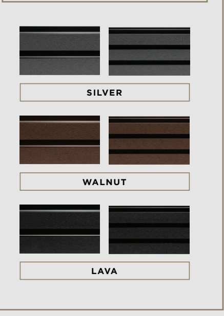
Board Dimensions: 50 x 201.5 x 1830mm

1800 x 1800mm panel consists of: 9 x HD Fence™ boards 1 x Aluminium bottom rail 1 x Aluminium finishing top rail 4 x Fixing brackets